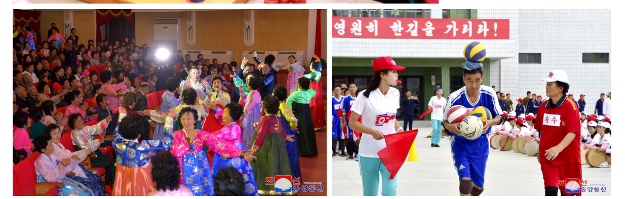
Old people observe the International Day of Older Persons with joy while conducting a variety of cultural and leisure activities.

The old people in different parts of the country enjoyed the day through diverse cultural and emotional life.