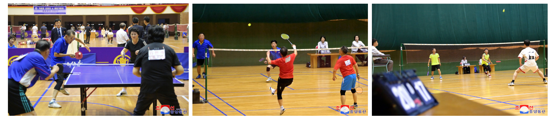
The Autumn Sports Contest of Aged People and Amateurs-2024 takes place at Pyongyang Indoor Stadium from September 27 to 30 on the occasion of the International Day of Older Persons.

Medals and diplomas were awarded to excellent players at the contest.