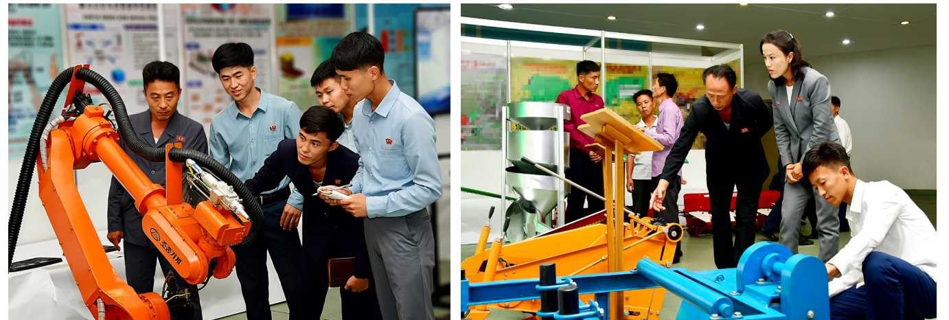
Visitors look at exhibits with keen interest at the 18th national festival of machine designs.

A gas plasma air disinfector brought out by the Nano Science and Technology Institute of Kim Chaek University of Technology drew the attention of visitors. It has made it possible to lower the manufacturing cost, curb the infection by and spread of infectious diseases through air and provide clean