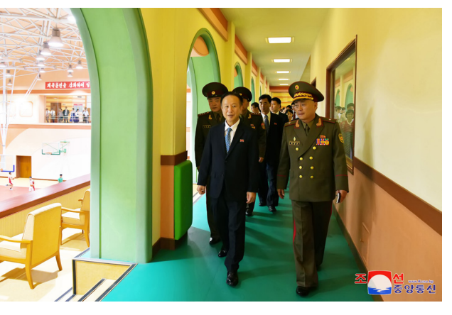
The congratulatory group of Koreans in Japan for celebrating the 76th birthday of the DPRK visit Mangyongdae Revolutionary School.

They left Pyongyang by air on September 17.