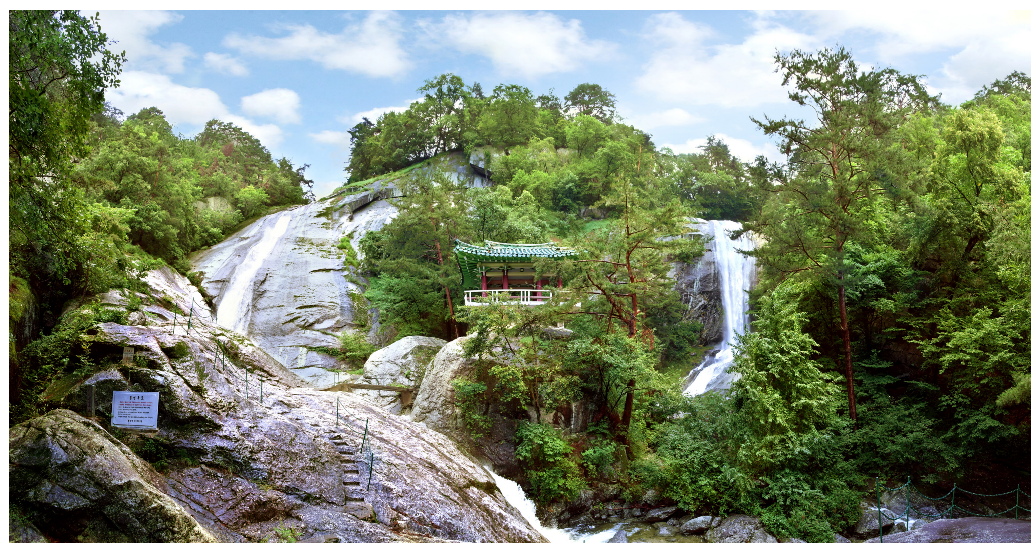
Sangwon Valley of Mt Myohyang, a celebrated mountain of Korea, in summer.